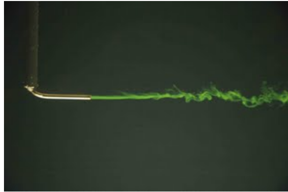
Figure 1. Short captions are centred.